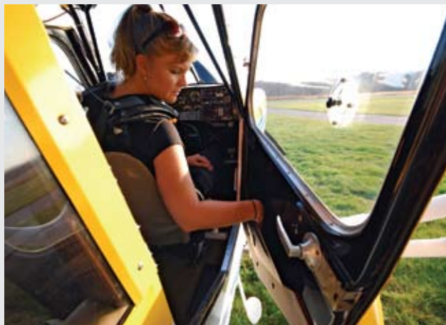
Removing all loose cockpit objects prior to aerobatic flight is critical.