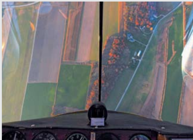
A windshield full of Mother Earth is a common sight during aerobatics.

to motion. For many people it might compare to public speaking or that first kiss—you probably know what I'm talking about. The adrenaline you get in a controlled training environment will pay big dividends in the real world.