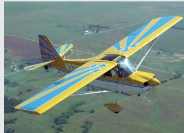
The Whitson's tried and true 1975 Decathlon.

you plan on using it tomorrow, but because you never know. Let's face it; no matter how well you plan, things don't always go according to plan. Have you ever been to a fly-in? Ever been in a traffic pattern with eight or more other planes all at different speeds and pilot skill levels? Ever tried to land a Bonanza or Cessna 210 behind a fleet of Cubs or ultralights? Then you know that sometimes planning isn't always enough.