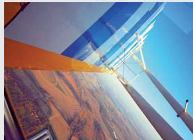
Experiencing some change of attitude.

The main reason to consider aerobatic training is simple—it may save your life and the lives of your passengers. If you were a police officer wouldn't you occasionally practice shooting your gun? Not because